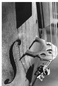
NEW T-shirt design available this year!

Invite family and friends! No concert dress required.